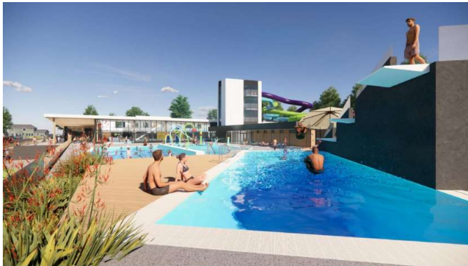
ARTIST'S IMPRESSION OF THE POTENTIAL INDOOR POOL AREA

Further investments in multi-use aquatics in the East and West timed to meet growth and as budget allows